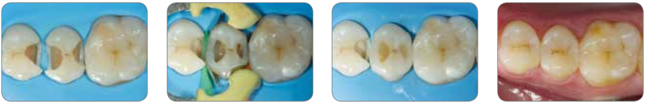
Clinical case by Dr Javier Tapia Guadix (Spain)

Most posterior cases will look perfect just using the very chromatic Dark Dentin together with Light Enamel , providing as such a very natural build-up in posterior.